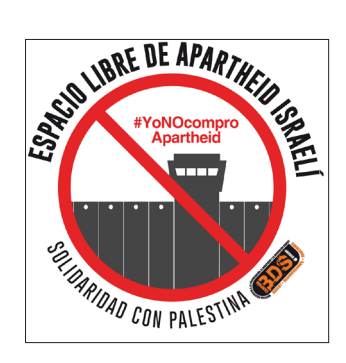
AFZ logo in the Spanish state