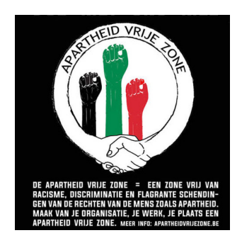
AFZ logo in Belgium